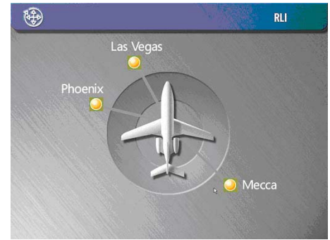
The RLI provides distance to various points of interest

The system works directly with the aircraft's Iridium satellite communications systems to take advantage of the low connection costs and global reach, JetMap II can also operate with other satellite communication systems via an on-board network. For added efficiency and simplified account management, JetMap II content service can be combined with Honeywell's OneLink™ Communications Services.