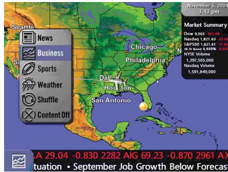
Passengers easily navigate content options

Business, General Aviation and Helicopters Honeywell International, Inc. 8323 Lindbergh Court Sarasota, FL 34243 Tel: 941-360-6100 Fax: 941-355-9241 www.honeywell.com